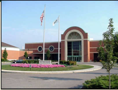
The Ehrnfelt Recreation & Senior Center