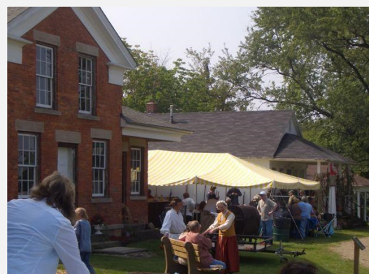
Strongsville Historical Society's Harvest Festival