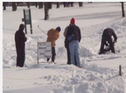
Strongsville Rotary's Chili Open for Charity