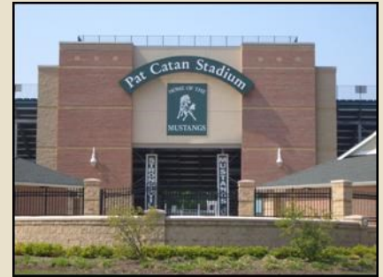
Pat Catan Stadium