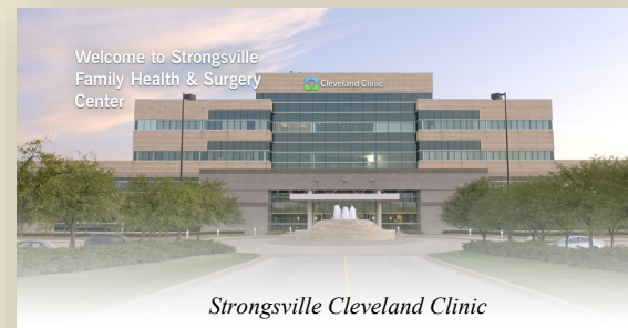
Strongsville Cleveland Clinic

Research institutions focused on innovation and medical technology in the region include: