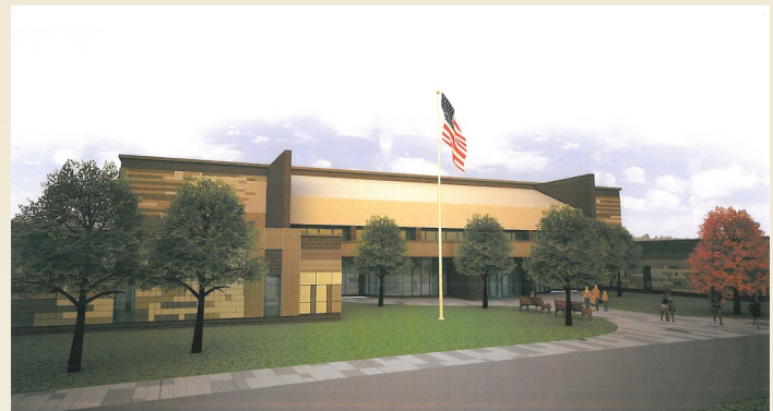
Rendering of Polaris Career Center after $50 million renovation

For full details regarding Polaris Career Center's Adult Education & Training Programs, please click below: