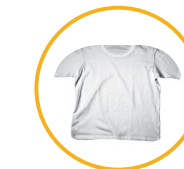
CLOTHING & TEXTILES

Shredded paper can make a mess if left curbside. Please place in a tied bag and drop in the River Valley Paper Recycling Bins (located at food bank, parks & fire stations).