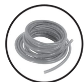
HOSES & ROPES