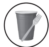
CUPS, LIDS & UTENSILS

Not all plastics are recyclable. We no longer refer to the number on the container, because not all numbered items can be recycled. Plastics like Styrofoam™, plastic cups and utensils, takeout containers and clamshells for lettuce and berries cannot be recycled curbside. Place these items in the trash: