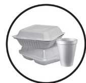
STYROFOAM™ & TAKE-OUT CONTAINERS