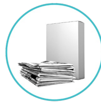
PAPER & BOXES

All of these can be placed in a marked container or blue bag. Set out RECYCLING on the opposite side of the driveway from the trash. If your recycling was not picked up or if you are having difficulty with Recycling pick-up, please contact Republic Waste at 440-572-7590. If you notice that a drop-off container is full, please contact us.