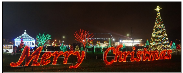
Strongsville's City Commons will light up for the holiday season Nov. 24, 2019 at the Winter Wonderland Lighting Celebration.

Then the evening's special guests — Santa and Mrs. Claus — will arrive in a horse-drawn carriage to greet children in their 'Sparkle Palace.'