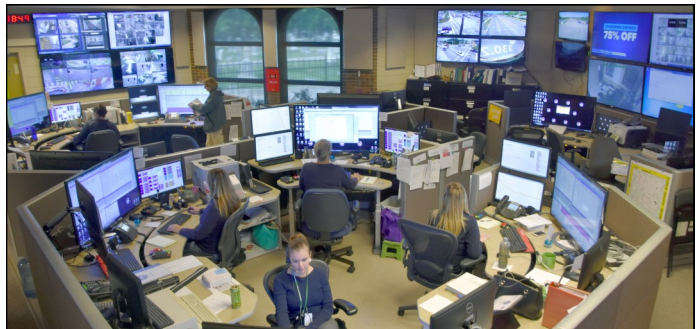
The Southwest Emergency Dispatch Center will serve five communities when Brook Park joins this November.