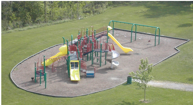
Volunteer Park Playground: 21410 Lunn Road