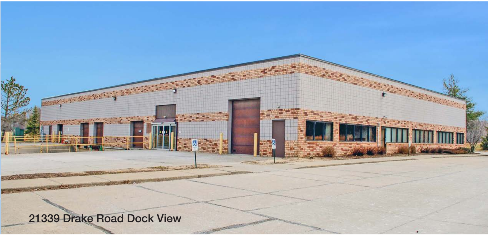
21339 Drake Road Dock View