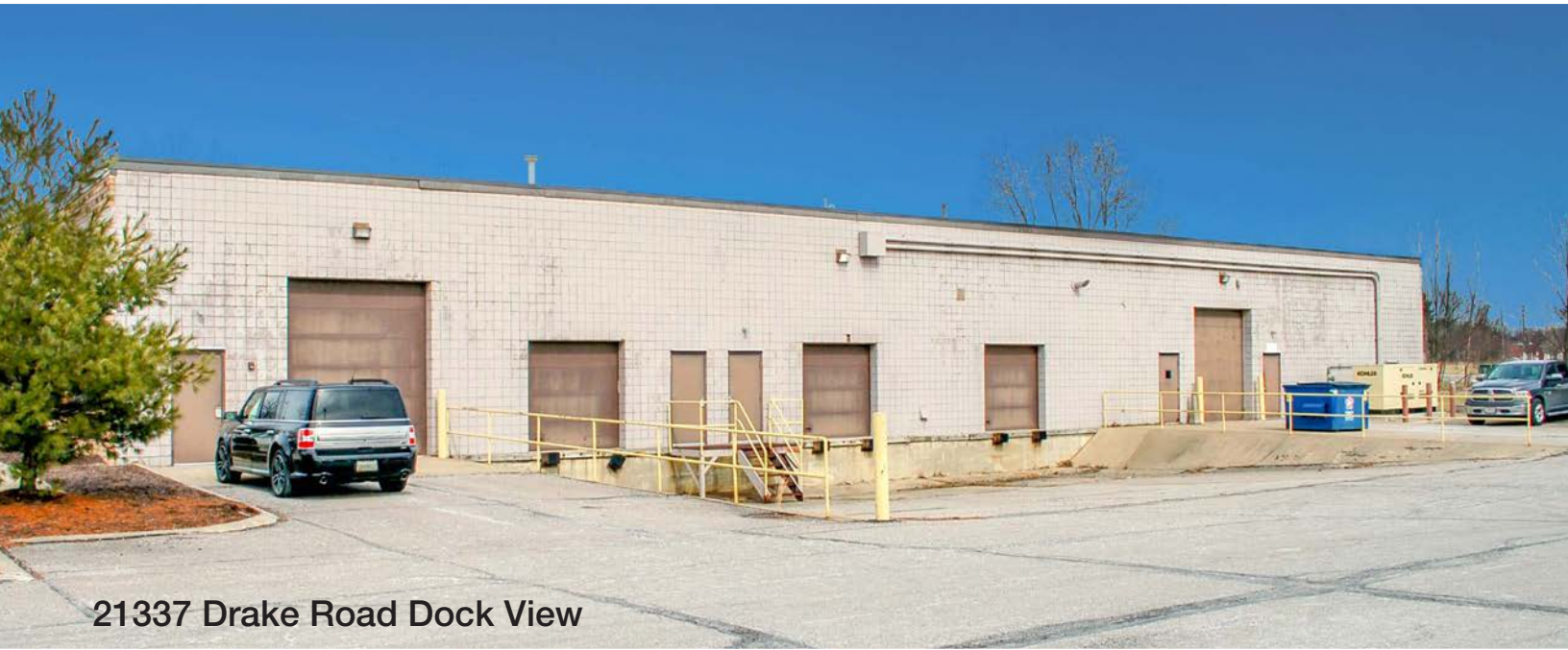
21337 Drake Road Dock View

For more information, contact our licensed real estate salespersons: