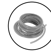
HOSES & ROPES