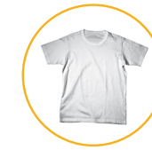
CLOTHING & TEXTILES (YOU MUST SCHEDULE PICKUP)

Shredded paper can make a mess if left curbside. Please place in a tied bag and drop in the River Valley Paper Recycling Bins (located at food bank, parks & fire stations).