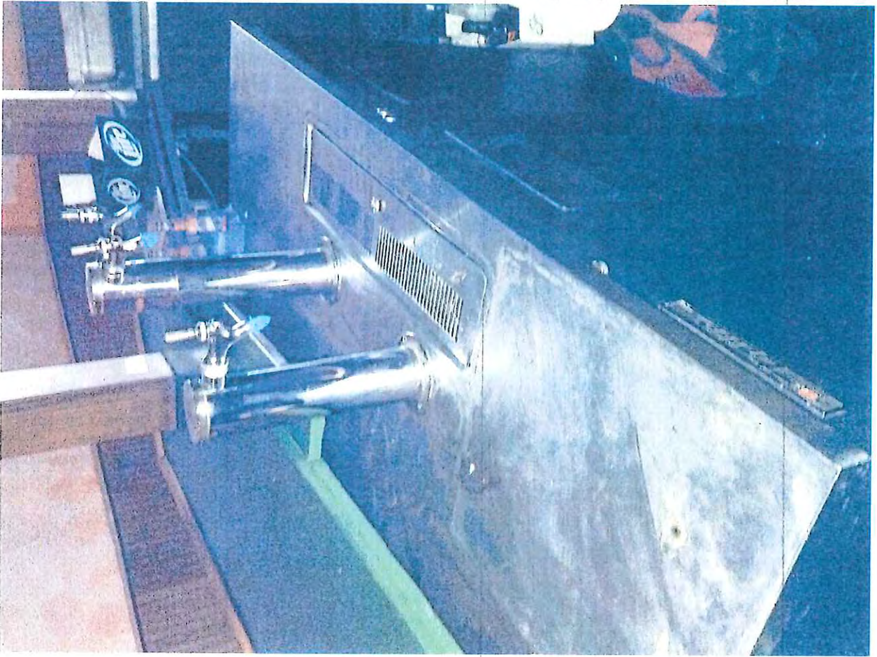
** 01/05/15 – Photos given to Council pertaining to the TREX (Transfer of Liquor Permit). **